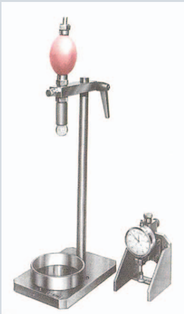
Dropping ball apparatus

Some of the equipment used to measure the consistence of fresh mortar.