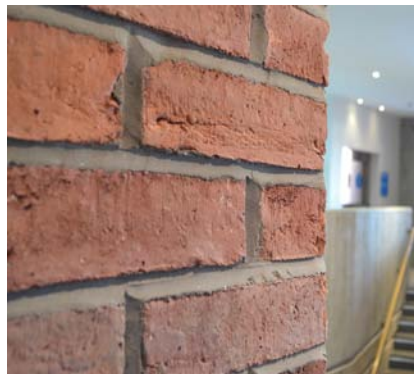
Brickwork detail of the Girdwood building

RTU supplied 350m 3 of standard grey mortar, which was used throughout the building along with 5,000m 3 of concrete. This was included in the stunning coffer ceiling and board mark concrete, both visible in the foyer,