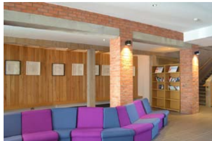
Downstairs area of the Girdwood building

ensure we could deliver the finish they required. We were more than happy to showcase our ability to meet these specific finishes. ”